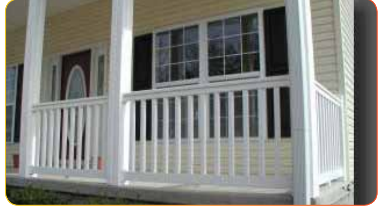
STANDARD RESIDENTIAL RAIL