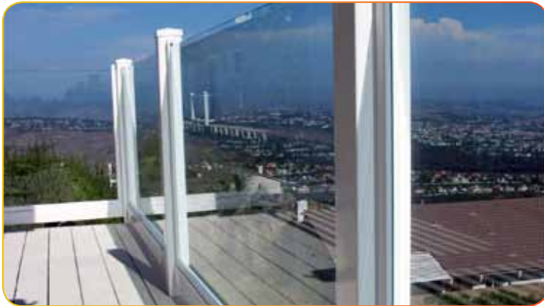
SCREEN INTEGRATED COMMERCIAL RAIL